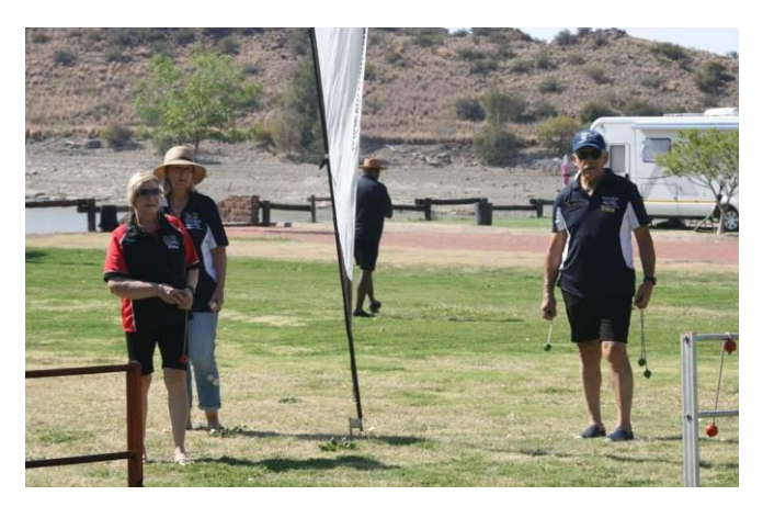
KZN – Hangballe