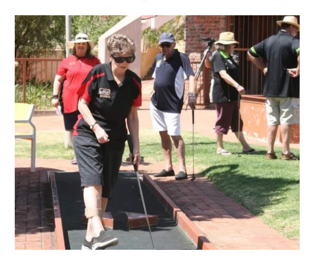
Vrystaat - Put Put