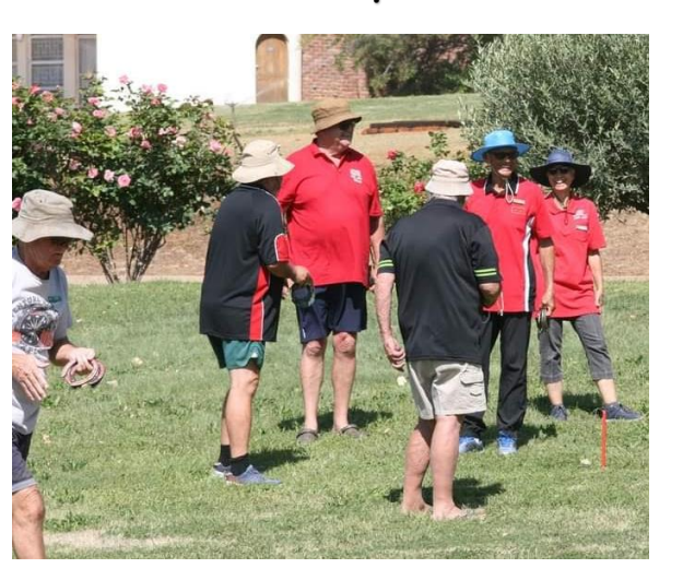
Mpumalanga - Hoefyster gooi