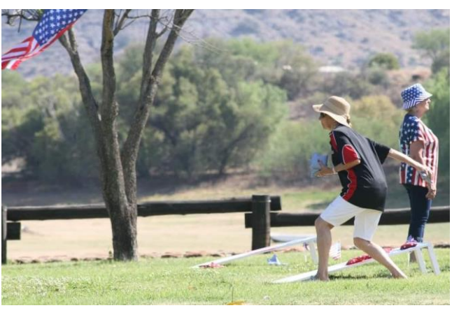
Eastern Cape - Corn Hole