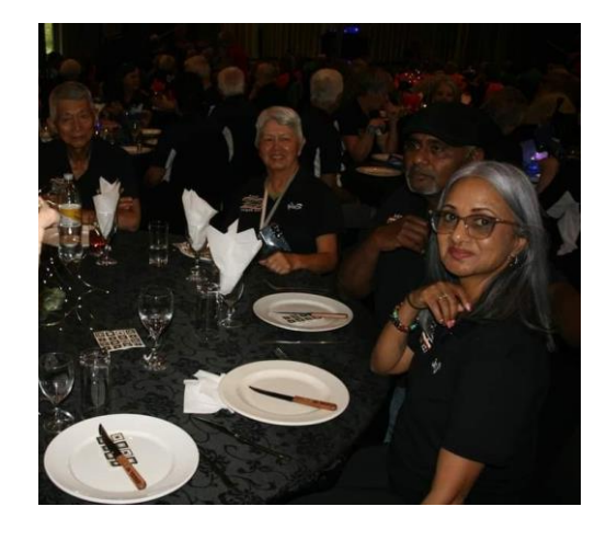
KWA ZULU NATAL